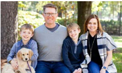
The Cofer Family