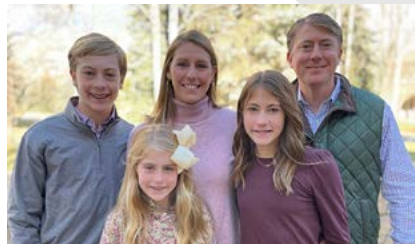
The Daly Family