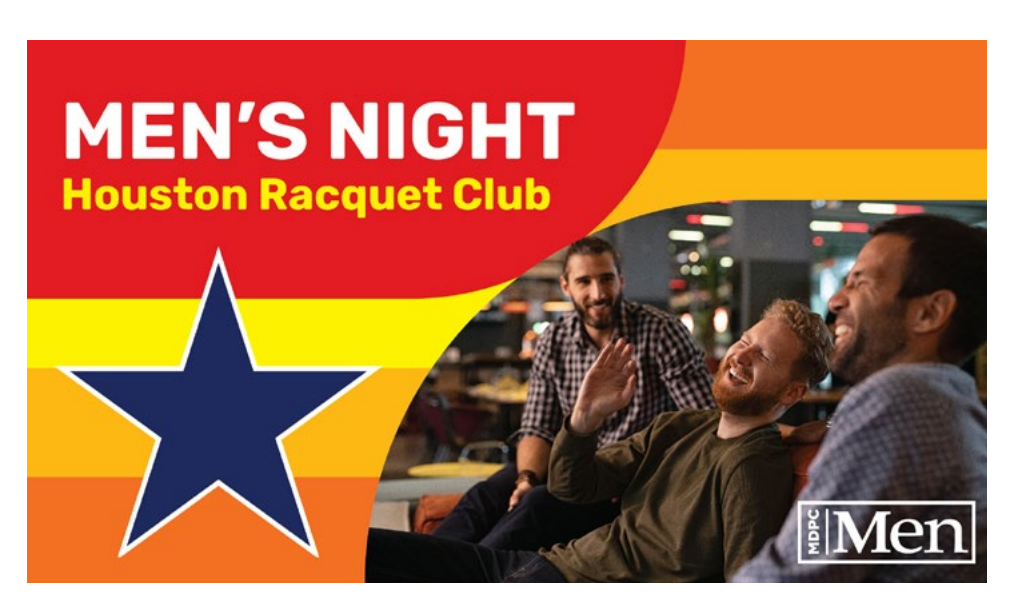
Tue, Aug 17 • 6-9p •$20 for food & drink

2021 Annual Budget $ 11,300,000 Income to Date $ 5,409,073 Needed to Meet Budget $ 5,890,927