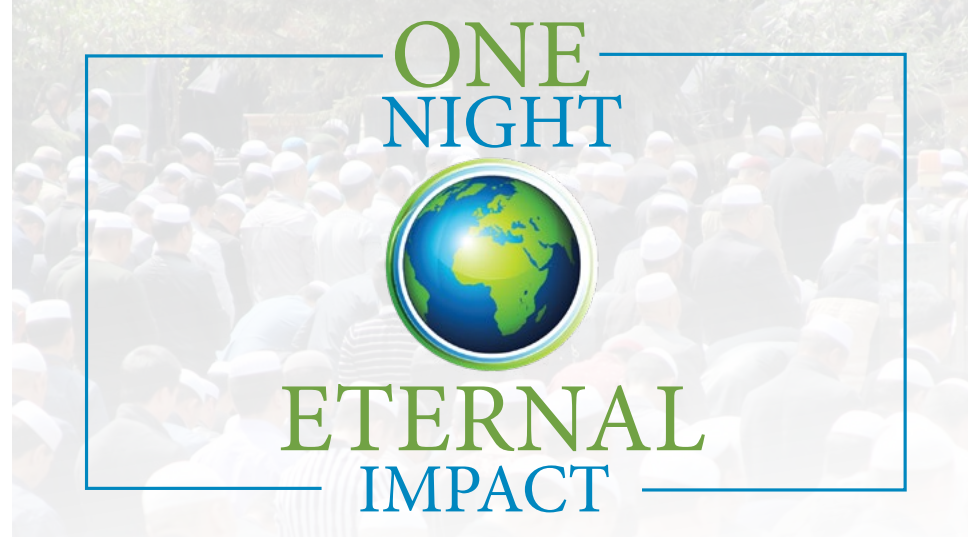
Sep 30 • 6:30p • MDPC Fellowship Hall

Texas is number one in the U.S. in food insecurity for children - but you can help, with two unique volunteer opportunities! Learn more and sign up at kidsmeals.mdpc.org .