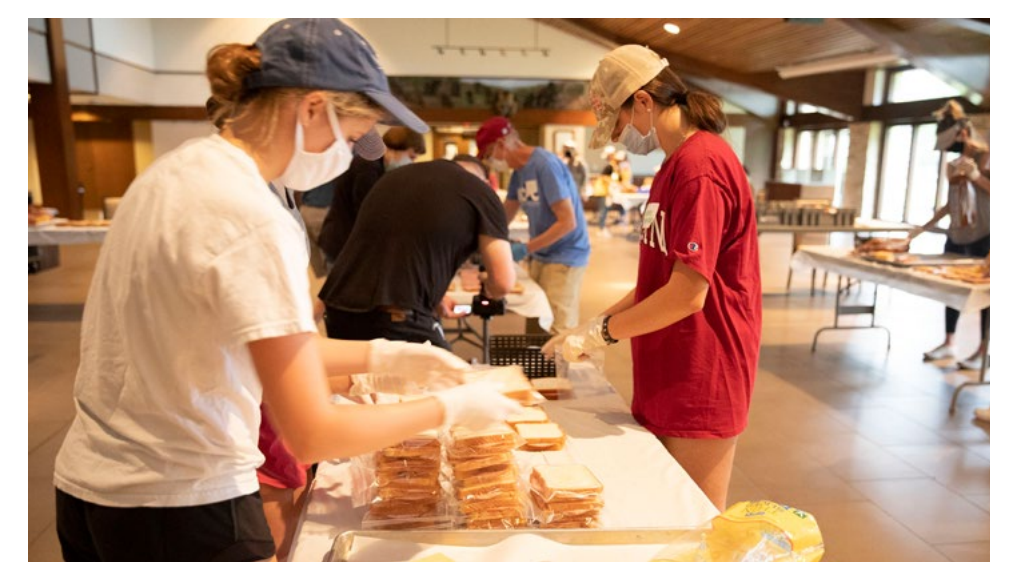
NO Kids' Meals in July • Make sandwiches at MDPC Aug 11

Men, invite your buddies to join us for a fun night out, with Astros on the big screen, Tex-Mex, beer, and fellowship with other men. Tickets at mensnight.mdpc.org .