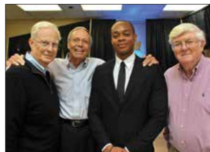
MDPC Men support Open Door Mission by building mentoring relationships.