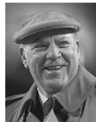
Robert C. McNair November 23, 2018