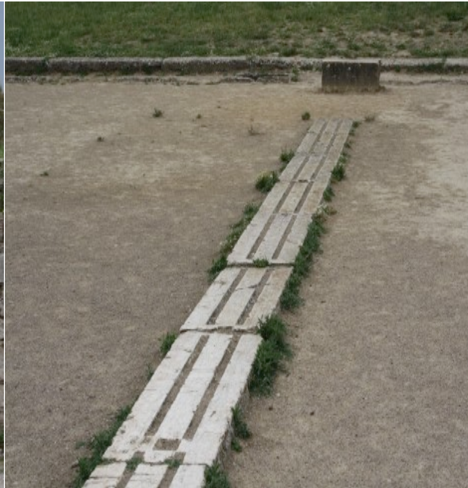
The starting line of the stadium in Olympia (4th century BCE) .