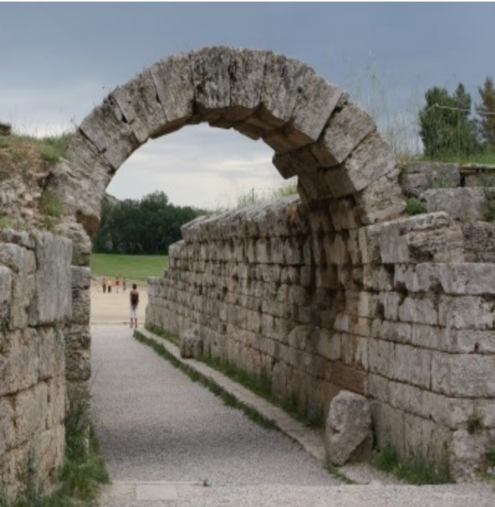
The Krypte, which was the official entrance to the stadium of Olympia (200 BCE) .