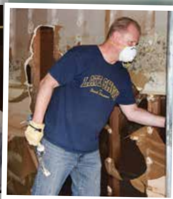
Harvey Work Crews