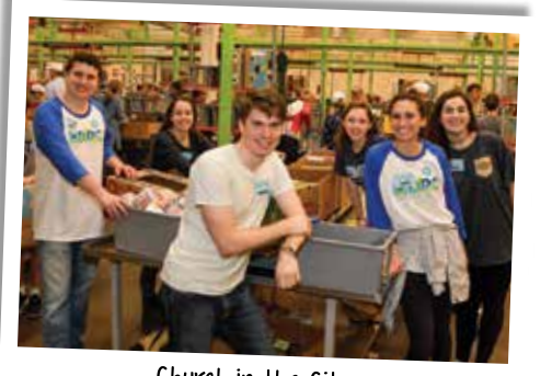
Church in the City