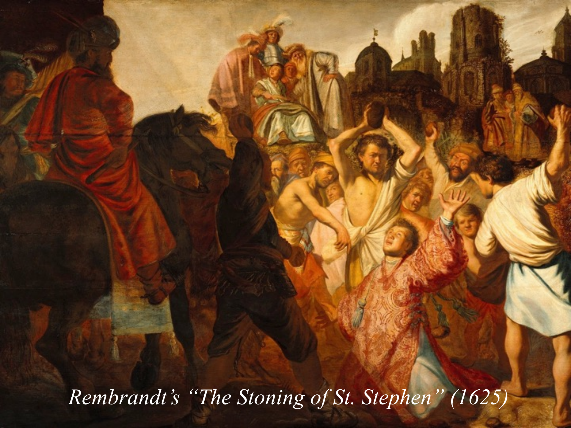
Rembrandt's "The Stoning of St. Stephen" (1625)