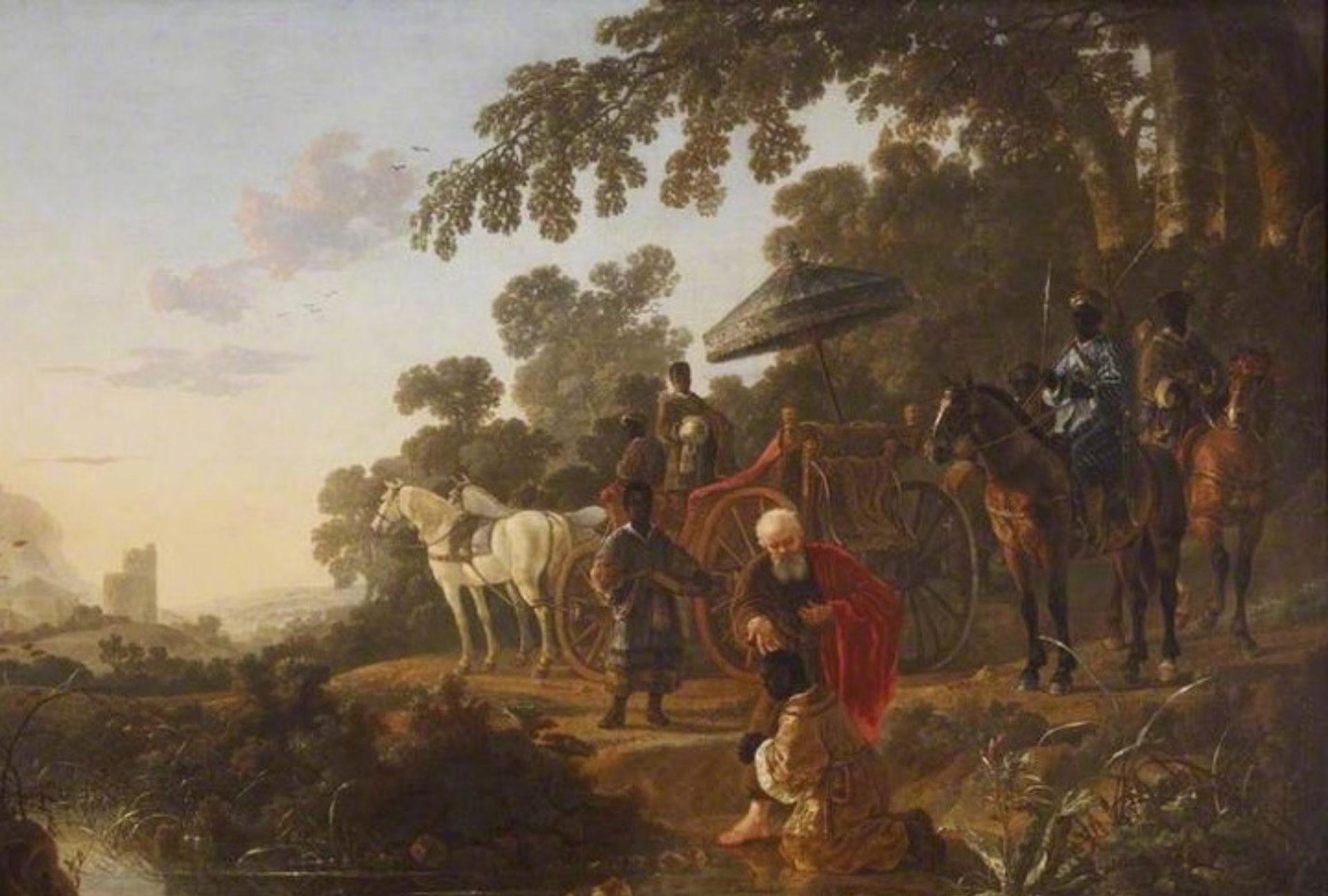
Aelbert Cuyp's "St. Philip Baptizing the Ethiopian Eunuch"